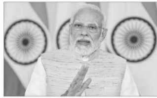
PM Narendra Modi during his virtual address on Friday

"Due to this, we have succeeded in increasing the production capacity of high-grade steel and reducing its import.